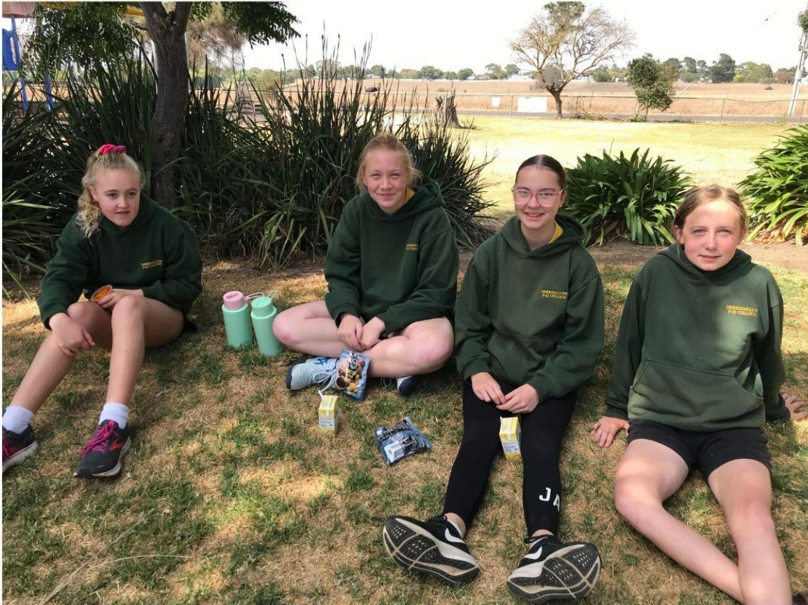
The girls enjoying a break from their hard work in the S.A.L.T workshop.